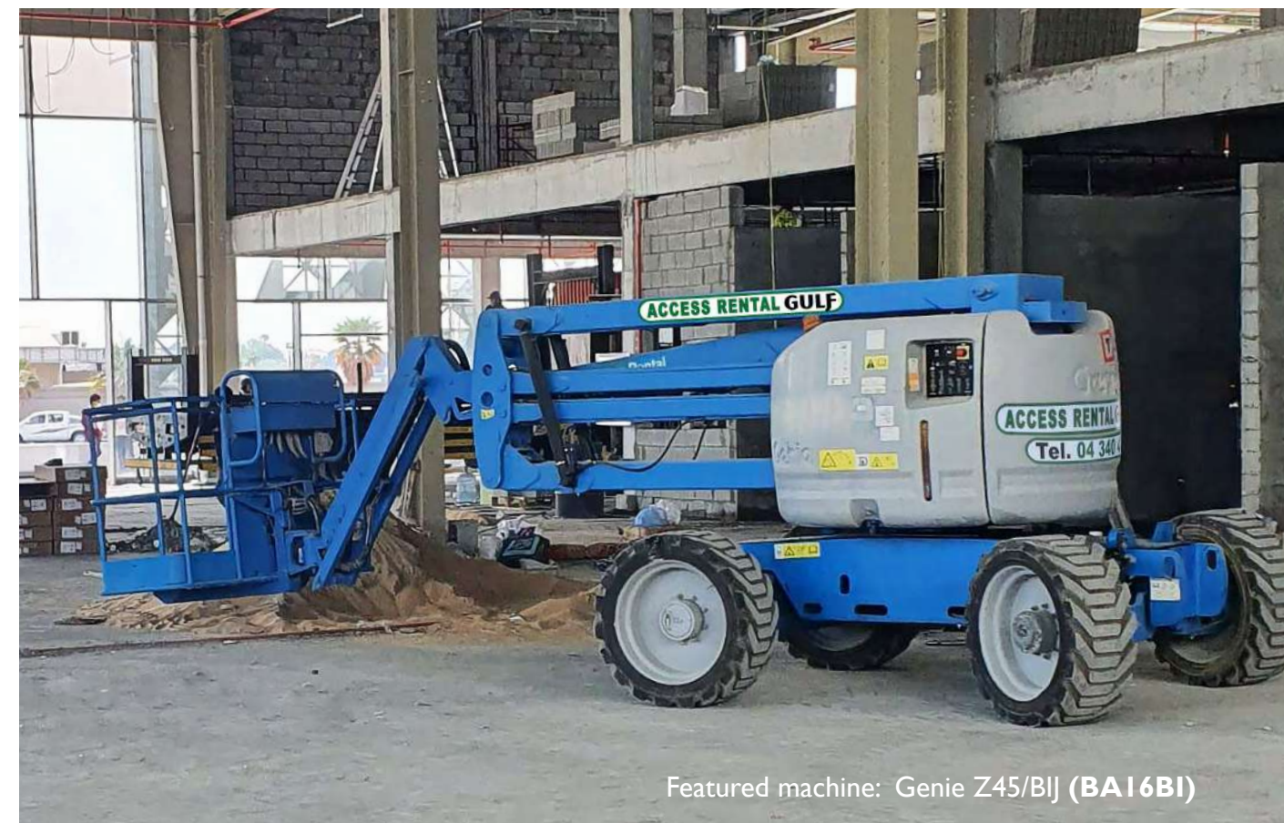
Featured machine: Genie Z45/BIJ (BAI6BI)