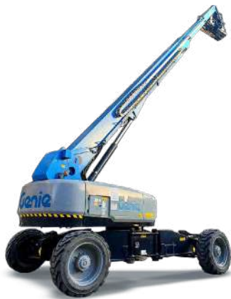
40m Diesel Telescopic Boom Lift BS28D Genie S125 Working Height: 40.15m Lifting Capacity: 227kg