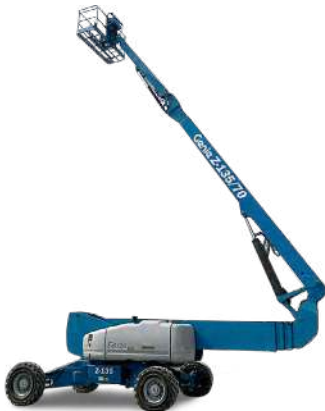
43m Electric Articulating Boom Lift BA43D Genie Z135/70 Working Height: 43.15m Lifting Capacity: 227kg