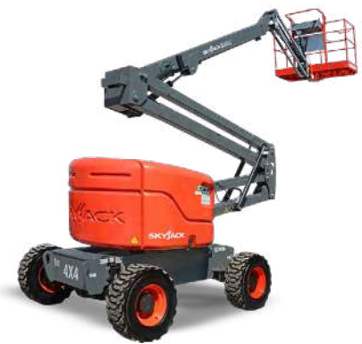
16m Diesel Articulating Boom Lift BA16D Skyjack SJ46AJ Working Height: 15.72m Lifting Capacity: 230kg