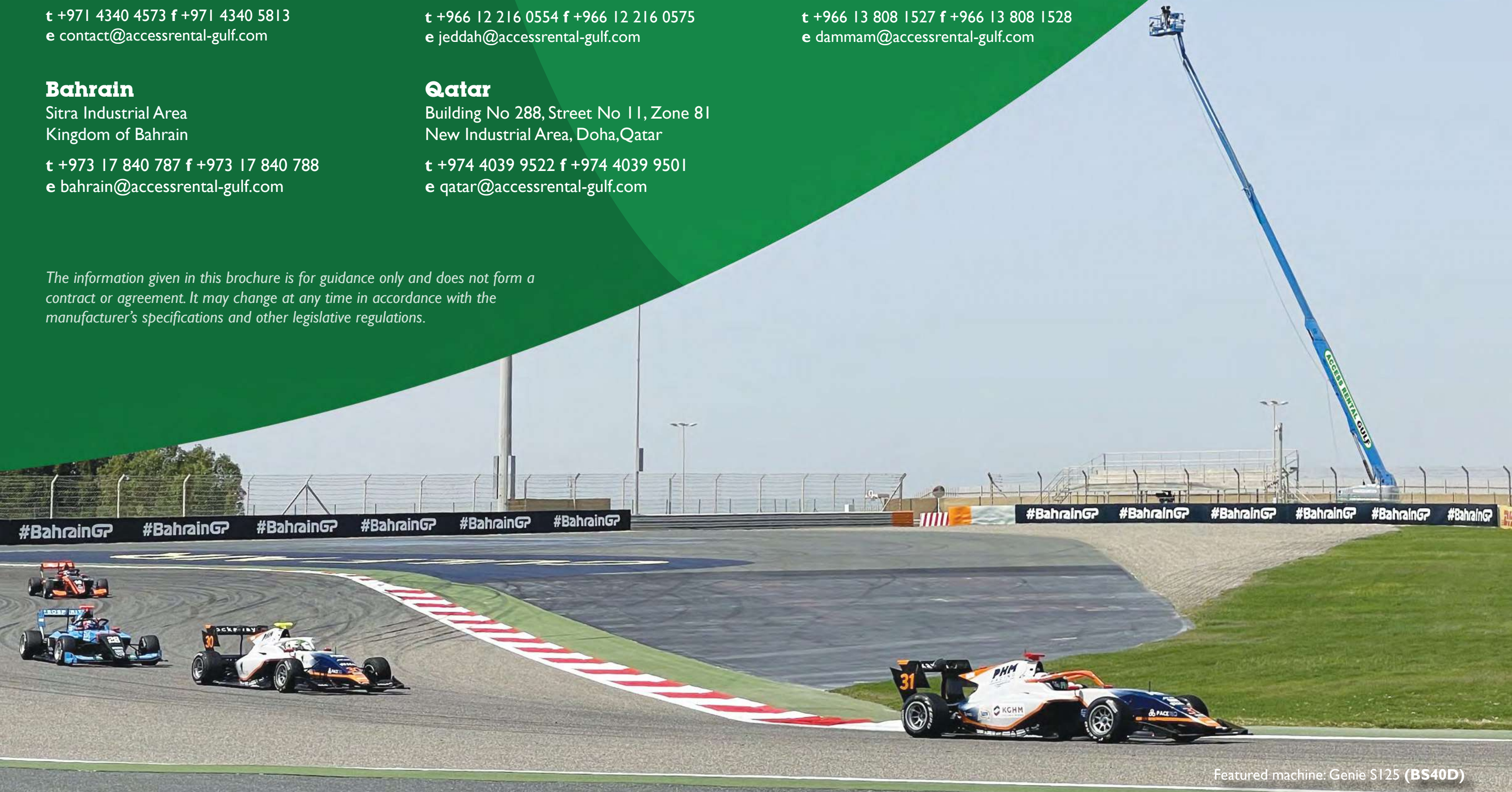
Featured machine: Genie S125 (BS40D)

The information given in this brochure is for guidance only and does not form a contract or agreement. It may change at any time in accordance with the manufacturer's specifications and other legislative regulations.