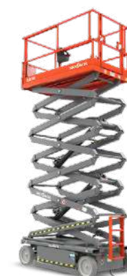
14m Electric Scissor Lift S14E Skyjack SJ4740 Working Height: 13.80m Lifting Capacity: 350kg