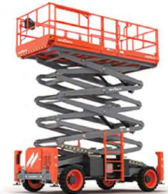
17m Diesel Scissor Lift S17D Skyjack SJ9250 Working Height: 17.20m Lifting Capacity: 681kg