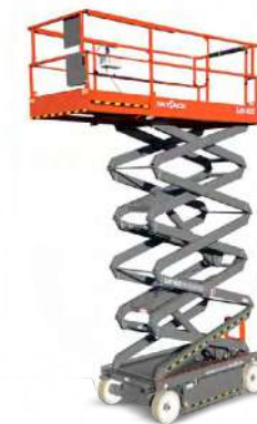
10m Electric Scissor Lift S10E Skyjack SJ4626 Working Height: 9.90m Lifting Capacity: 454kg