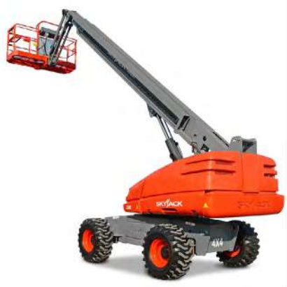
22m Diesel Telescopic Boom Lift BS22D Skyjack SJ66T Working Height: 22.12m Lifting Capacity: 227kg