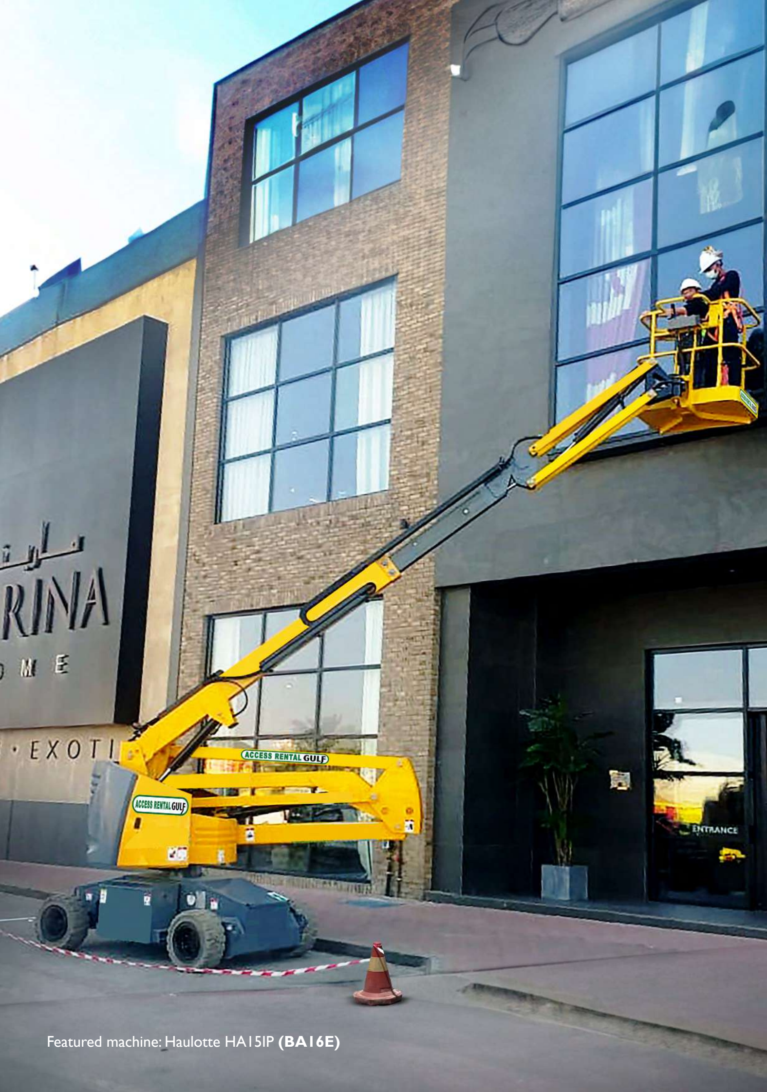
Featured machine: Haulotte HA15IP (BAI6E)