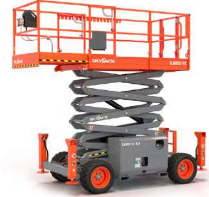
12m Diesel Scissor Lift S12D Skyjack SJ6832RT Working Height: 11.80m Lifting Capacity: 454kg