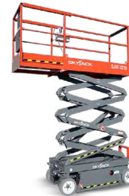
8m Electric Scissor Lift S08E Skyjack SJ3219 Working Height: 7.80m Lifting Capacity: 227kg