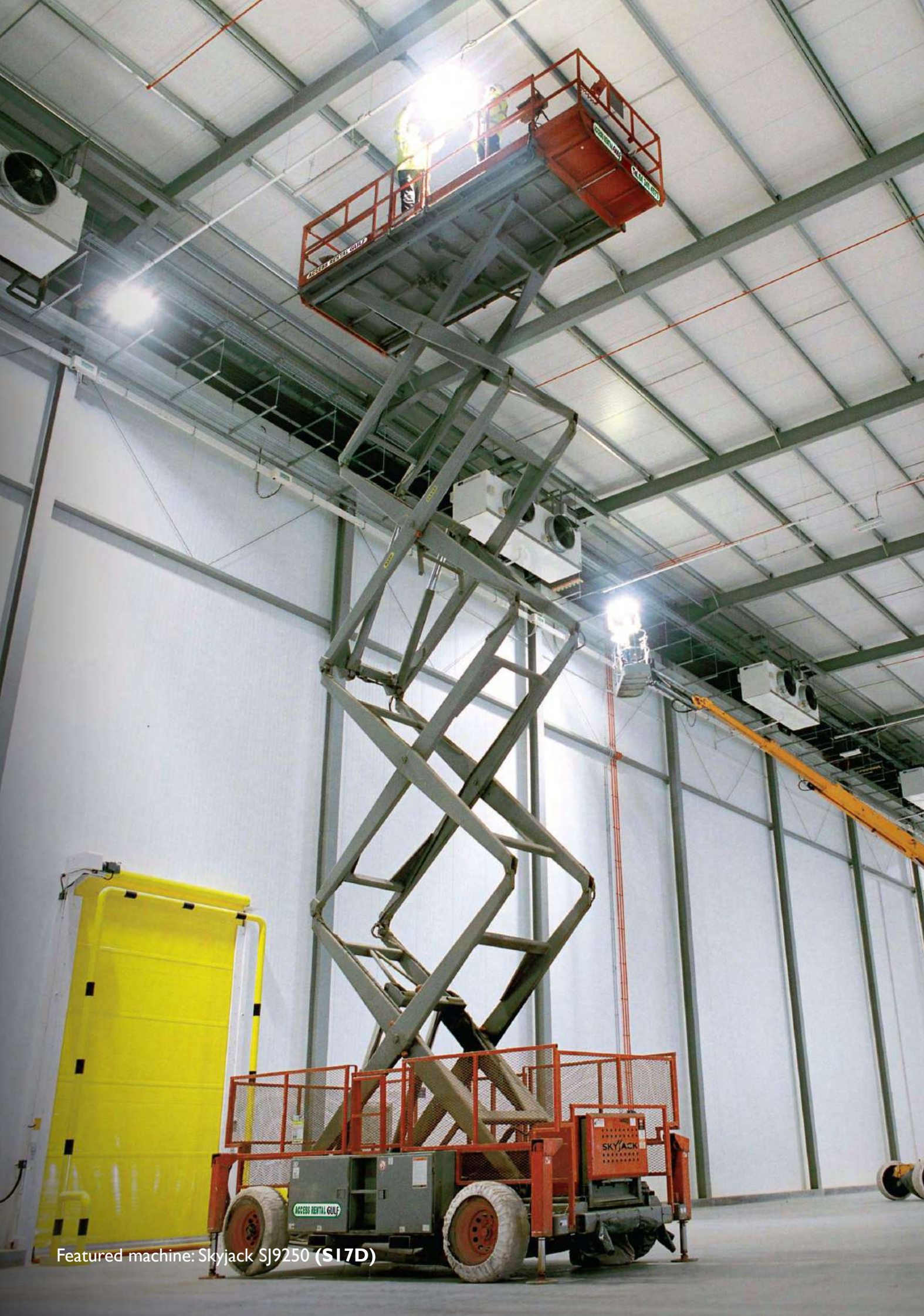
Featured machine: Skyjack SJ9250 (SI7D)