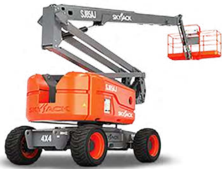
28m Diesel Articulating Boom Lift BA28D Skyjack SJ85AJ Working Height: 27.91m Lifting Capacity: 227kg