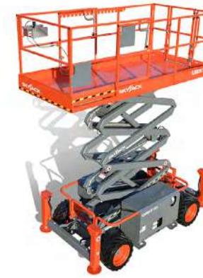
10m Diesel Scissor Lift S10D Skyjack SJ6826RT Working Height: 9.90m Lifting Capacity: 567kg