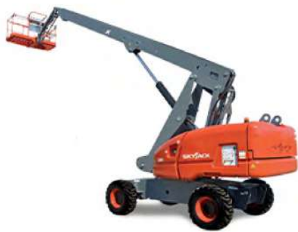
28m Diesel Telescopic Boom Lift BS28D Skyjack SJ86T Working Height: 28.21m Lifting Capacity: 227kg