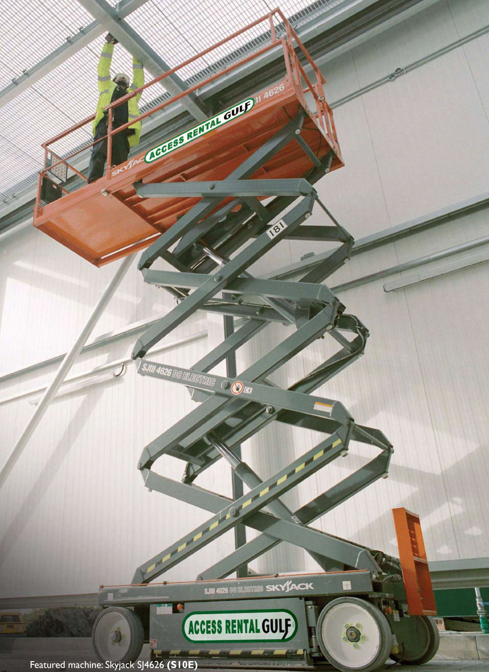
Featured machine: Skyjack SJ4626 (S10E)