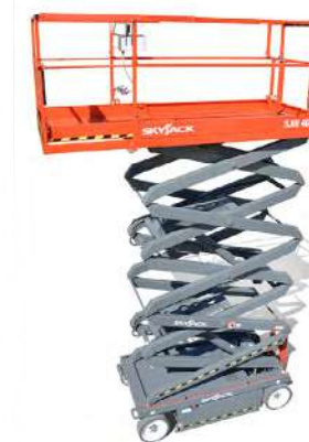
12m Electric Scissor Lift S12E Skyjack SJ4632 Working Height: 11.80m Lifting Capacity: 318kg