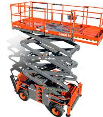
14m Diesel Scissor Lift S15D Skyjack SJ884I Working Height: 14.50m Lifting Capacity: 681kg