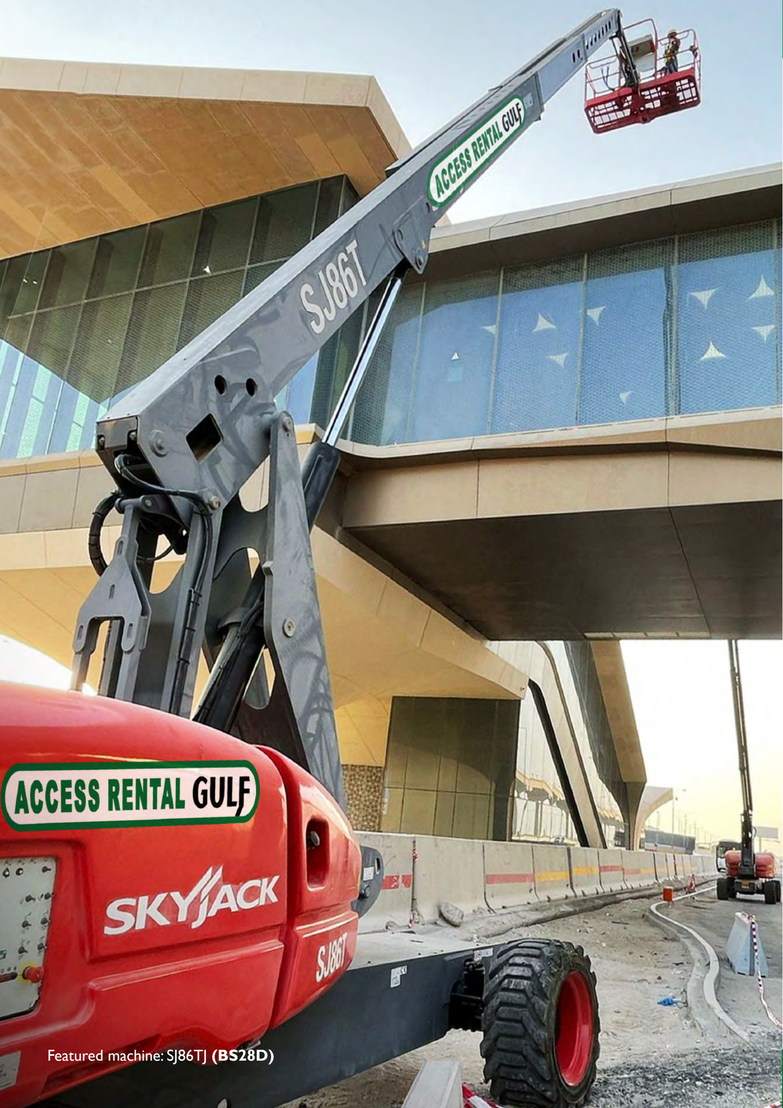
Featured machine: SJ86TJ (BS28D)