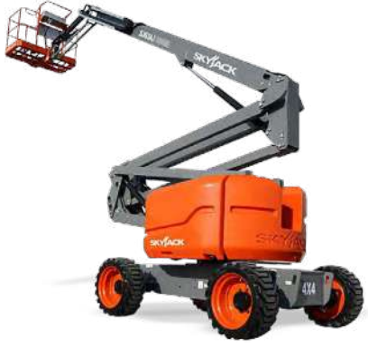
21m Diesel Articulating Boom Lift BA20D Skyjack SJ63AJ Working Height: 21.38m Lifting Capacity: 227kg