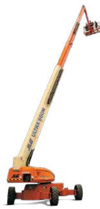
43m Diesel Telescopic Boom Lift BS43D JLG 1350JPS Working Height: 43.30m Lifting Capacity: 230kg