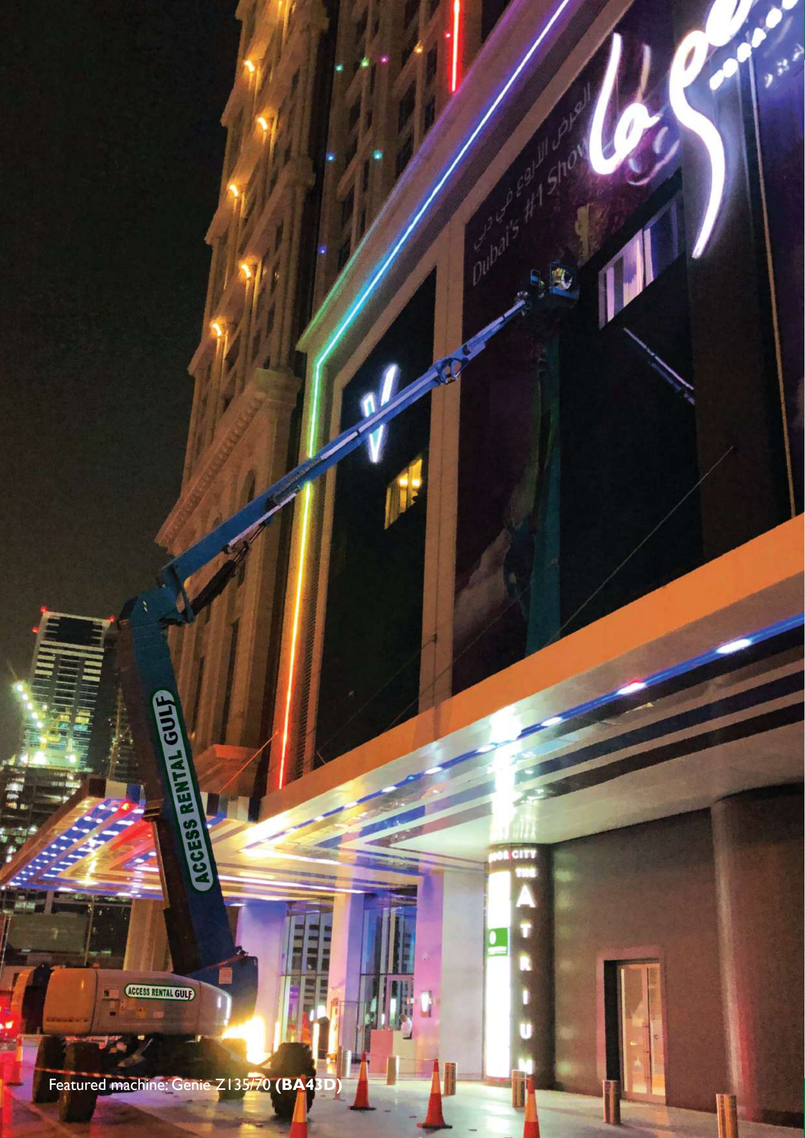
Featured machine: Genie Z135/70 (BA43D)